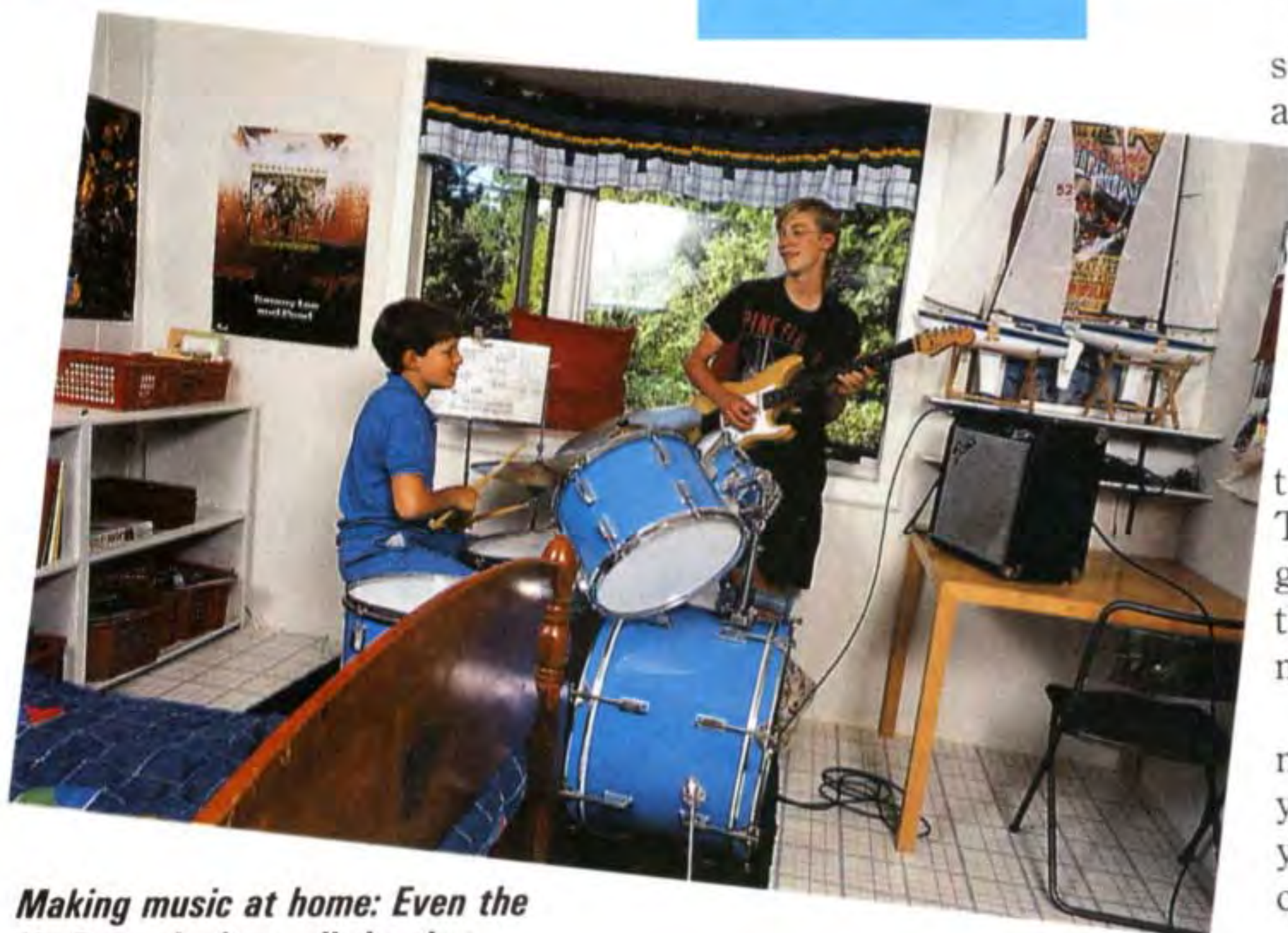
Making music at home: Even the Yo Bros. don't yo all the time.